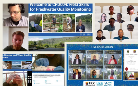
Graphic 2. A selection of highlights from 2021 for the UNEP GEMS/Water CDC, including course launches, graduations, and training activities.