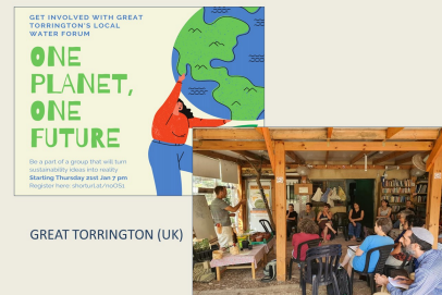
GREAT TORRINGTON (UK)