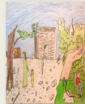
GREATER AMMAN MUNICIPALITY