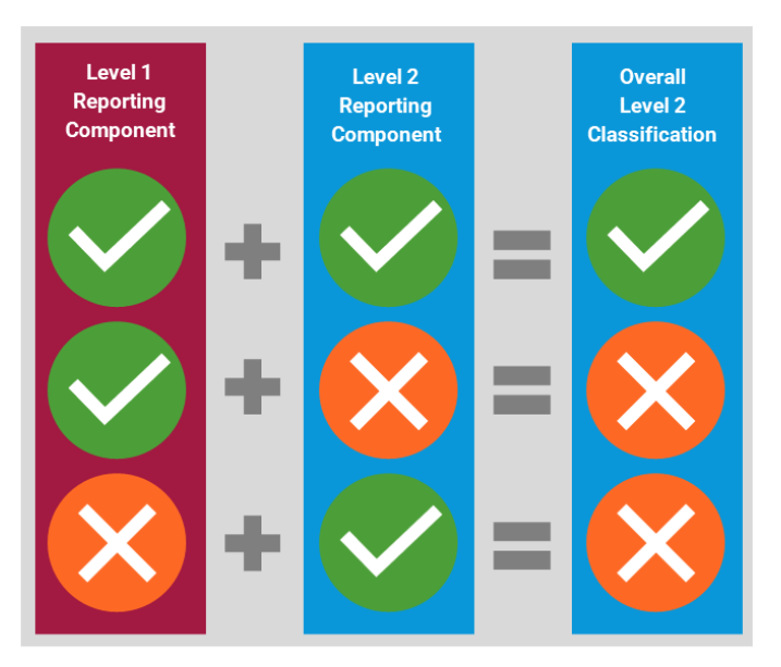
Figure 4: Example of Level 2 data integration with Level 1 using a one out, all out approach

A limitation of this approach is that for countries which are actively expanding their monitoring capacity, over time it may appear that water quality is degrading. In reality, the apparent degradation may simply reflect the